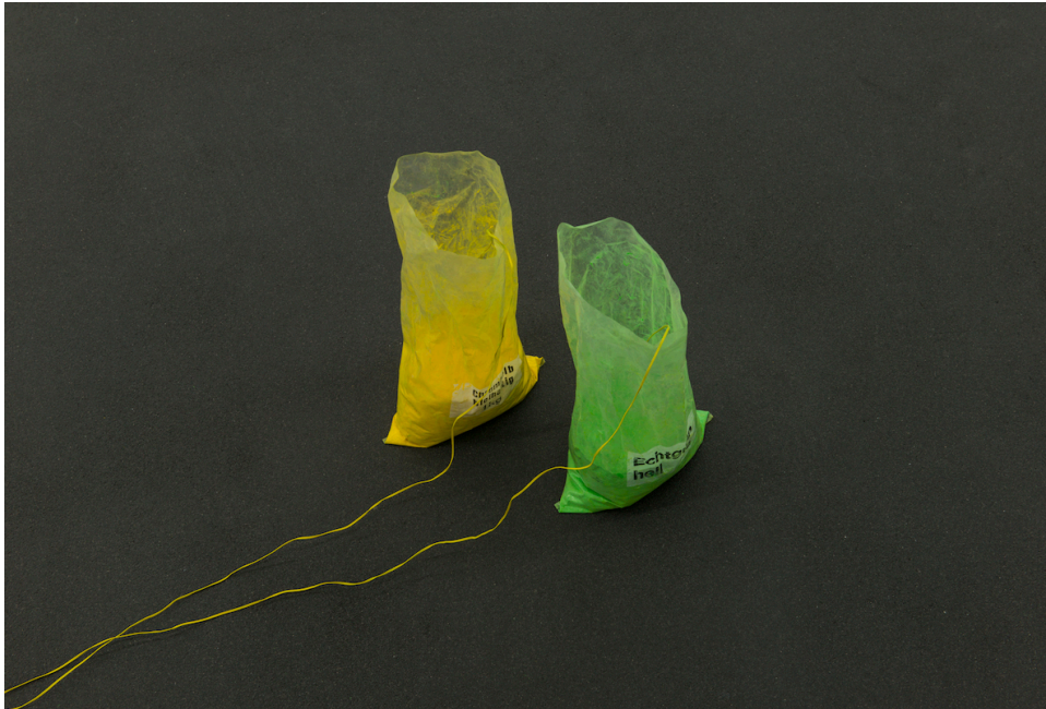
Grün Gelb, 1987 / 2015 2 plastic bags, pigment, 2 loudspeaker, CD- Player, wires. Unique copy, dimensions variabel.