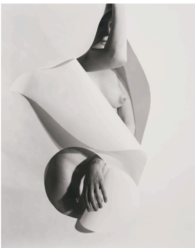
Jeffrey Silverthorne: »Nude with Cut Paper«, 1979

The exhibition is complemented by works from the 1980s and 1990s that are close to the artist's heart and each give a very brief insight into the many different series of his oeuvre.