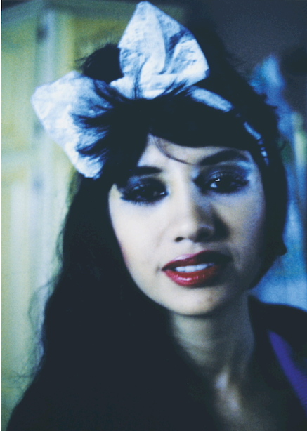
Jeffrey Silverthorne: »Woman with bow«, 1986/1991

out his reference to the tradition of European painting. On the other hand, he clearly underlines the narrative and dramaturgical approach of his photography. Aurora, the goddess of dawn, is shown as the personification of Lucretia, who is believed to be the trigger of the Roman republic. The female model is the center of this series, as in many of Silverthorne's works.