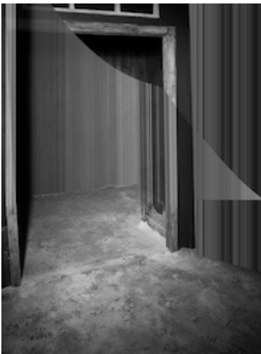
Steffi Klenz: »Untitled«, 2015-16

The London based German artist Steffi Klenz (b. 1979) mainly deals with architecture in her photography without creating classical architectural photographs. On a meta-level the photographic image is simultaneously questioned, alienated, and recurrently appropriated. She uses archival material as well as her own images for this.