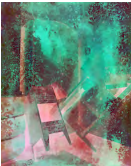
Steffi Klenz: »Untitled«, 2012-13

Recently, Steffi Klenz's works were exhibited in the following institutions: LA Center for Digital Art, Los Angeles, US (2015); St. Albans Museums, Hertfordshire, UK (2015); Centre for Contemporary Arts, Glasgow, UK (2014); Künstlerhaus Bethanien, Berlin, DE (2013); Finnish Museum of Photography, Helsinki, FI (2012), Goethe-Institut, Glasgow, UK (2010).