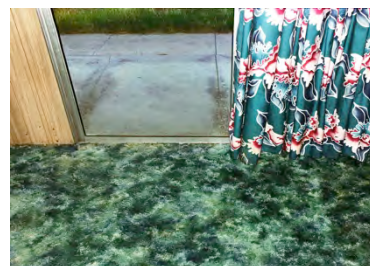
Pamela Littky: »Carpet and Drapes«, 2010 From the series »Vacancy« Archival Pigment Print 40,64 x 50,80 cm Ed. 9 + 1 AP

Contact for further information and press images: Pauline Friesecke: pauline.friesecke@kehrergalerie.com T +49 (0)30 688 16 949