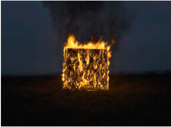
Danila Tkachenko: »#2«, 2017 From the series »Motherland« Archival Pigment Print 96 x 120 cm Ed. 9 + 2 AP

23,000 villages have disappeared from the maps over the last 20 years, while 76 % of the Russian population is gathered in big cities.