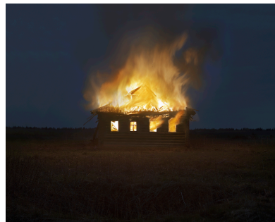
Danila Tkachenko: »#4«, 2017 From the series »Motherland« Archival Pigment Print 50 x 62,5 cm Ed. 12 + 2 AP

Contact for further information and press images: Pauline Friesecke: pauline.friesecke@kehrergalerie.com T +49 (0)30 688 16 949