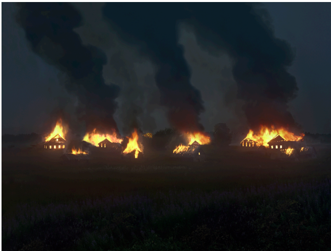
Danila Tkachenko: »#1«, 2017 From the series »Motherland« Archival Pigment Print 96 x 120 cm Ed. 9 + 2 AP

For his award-winning series »Restricted Areas« (2013–2015), Tkachenko travelled the different states of the former Soviet Union in two consecutive winters, looking for abandoned and derelict industrial structures that once represented industrial progress of this country.